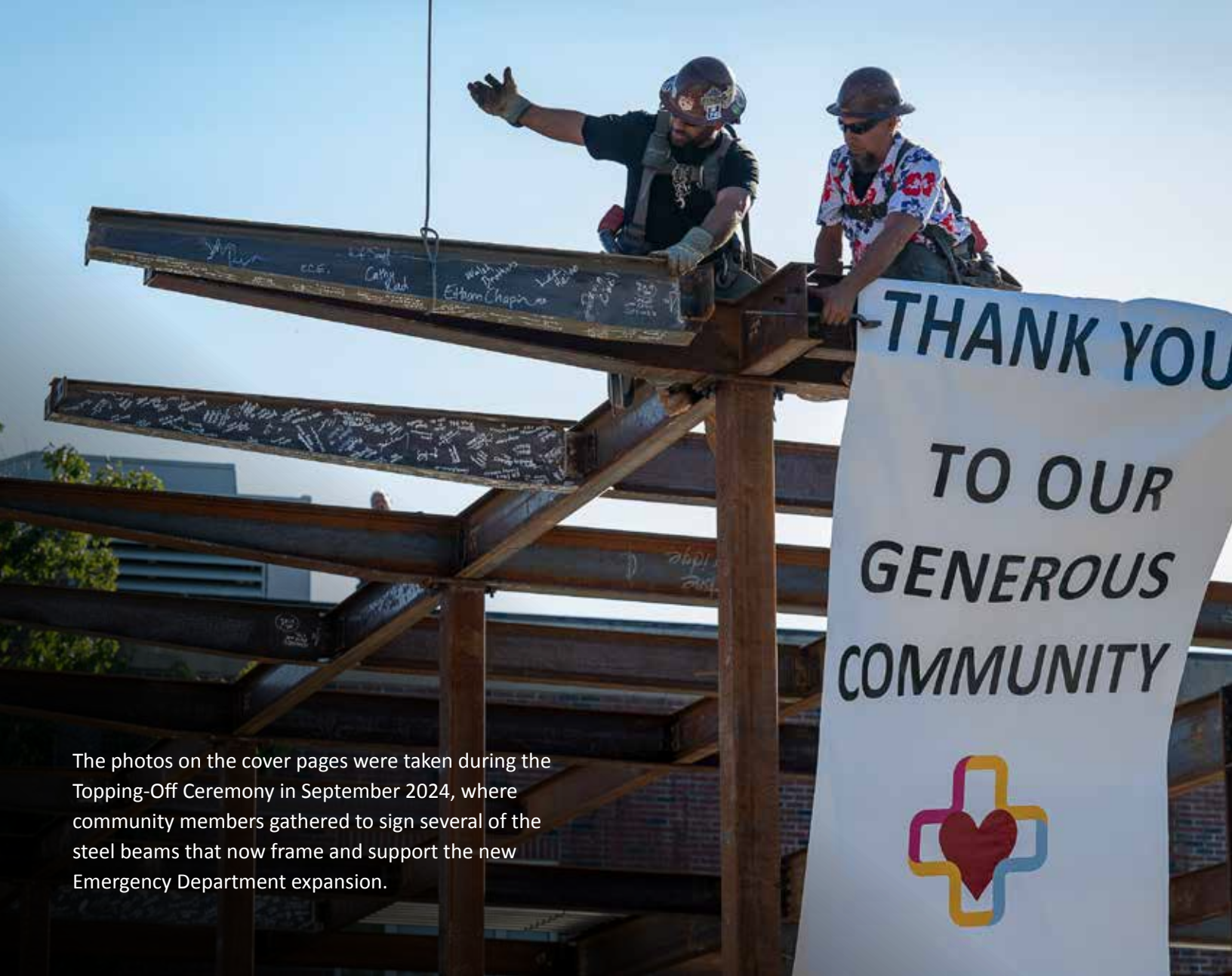
The photos on the cover pages were taken during the Topping-Off Ceremony in September 2024, where community members gathered to sign several of the steel beams that now frame and support the new Emergency Department expansion.